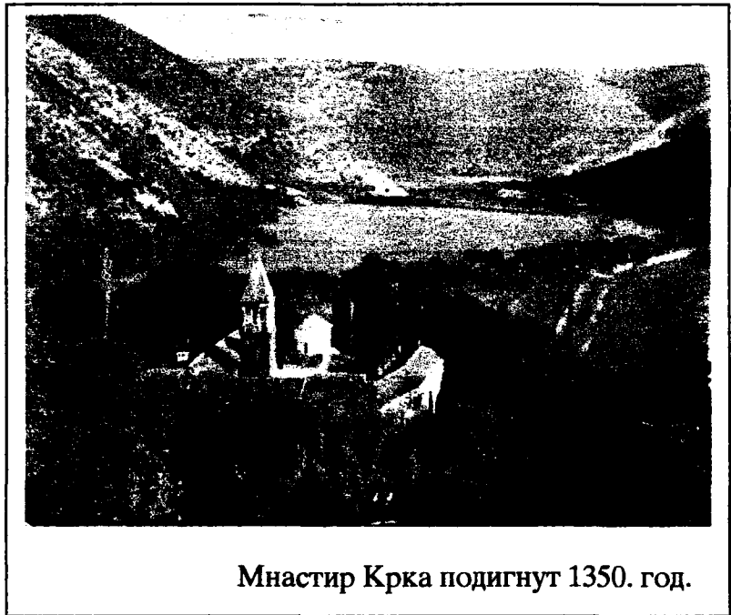
Мнастир Крка подигнут 1350. год.

Прота Д. Алимпић "Српски Сион" број 1/2000.